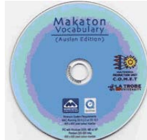
CD-Rom – $28.00